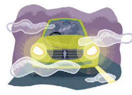
6 It's _____.