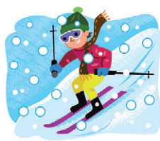
1 It's _____.