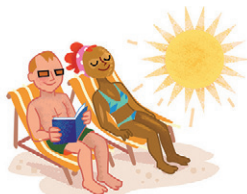
2 It's _____.