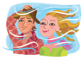
4 It's _____.