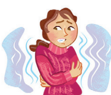
3 It's _____.