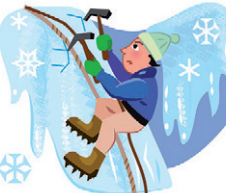
5 It's _____.