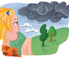
7 It's _____.

3 * Match the adjectives to the correct temperature.