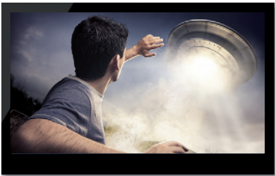
0 science fiction film

3 ** Write the types of films under the pictures.