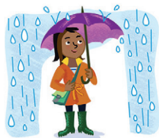
0 It's raining .

2 * Look at the pictures. What's the weather like?