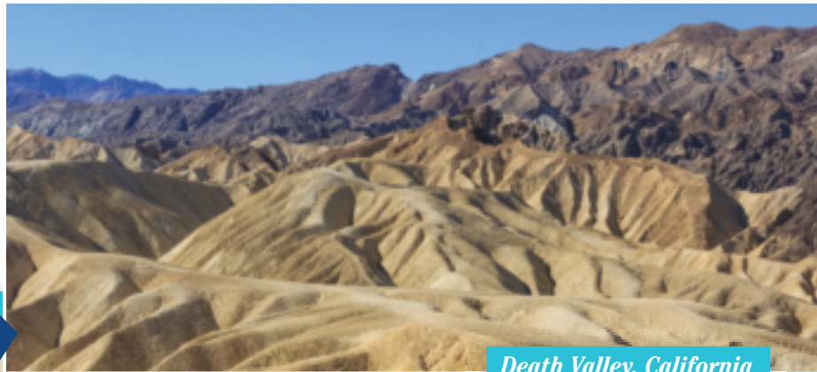
Death Valley, California