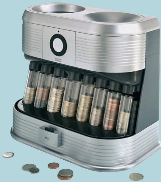
a coin sorter

Imagine you are going to give a product presentation for one of the products below. a Choose the product you would like to present.