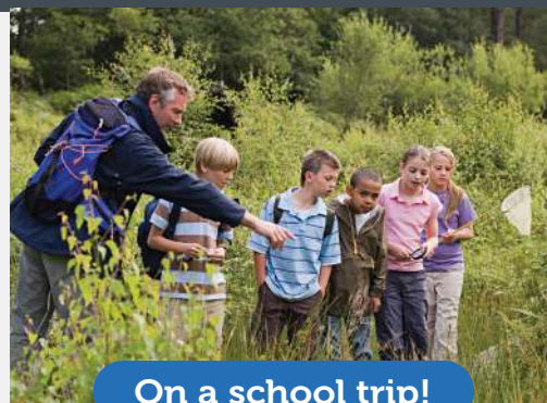
On a school trip!