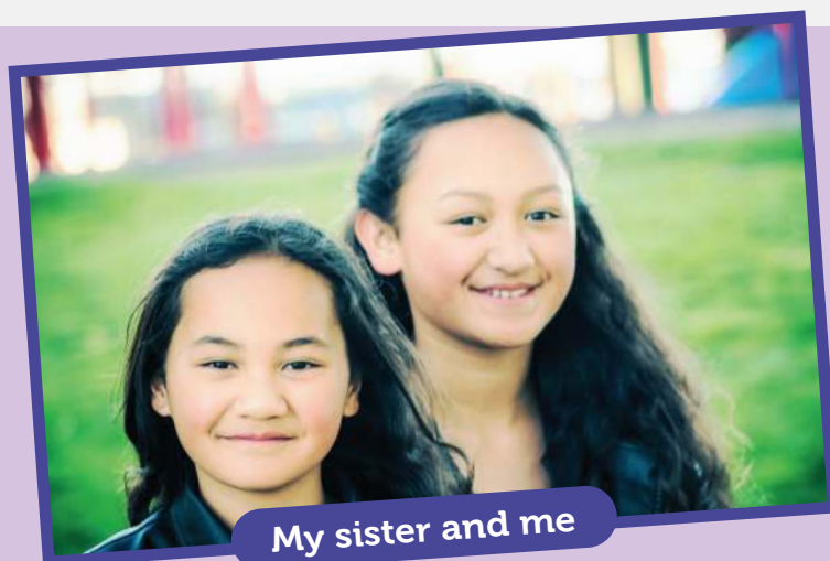
My sister and me

I am Māori. We are the indigenous people of New Zealand. Māori people have been living on these islands for hundreds of years. We have our own language, culture, and beliefs. We have lots of great stories and dances.