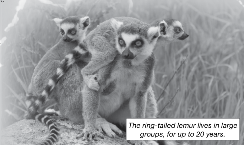
The ring-tailed lemur lives in large groups, for up to 20 years.

The charity is looking 7 for/of 20 volunteers for a project next January. You have to pay 8 on/for your flights and also £500 for a two-week project. They spend the money 9 on/with schools and clean water – Madagascar isn't a rich country. Accommodation and meals are free.