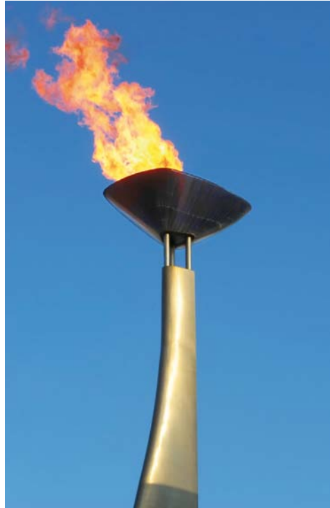
the Olympic torch

After many days or weeks, the last athlete arrives and lights the big flame in the Olympic stadium. Now the Games can start!