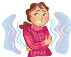
3 It's _____.