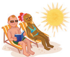
2 It's _____.