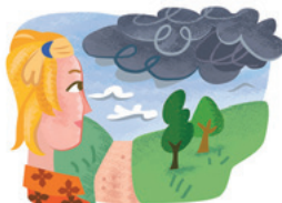
7 It's _____.