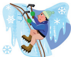
5 It's _____.