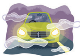
6 It's _____.