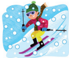
1 It's _____.