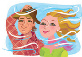
4 It's _____.